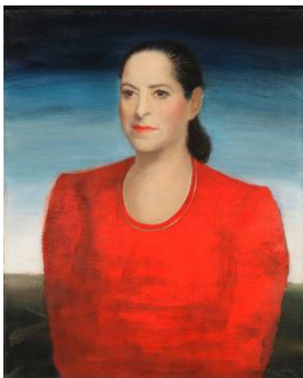
6. Candido Portinari. Portrait of Helena Rubinstein Oil on canvas, 1939 Musée d'art de Tel-Aviv, gift of Helena Rubinstein