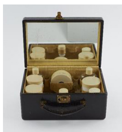
Valaze vanity case 1910 s Paris