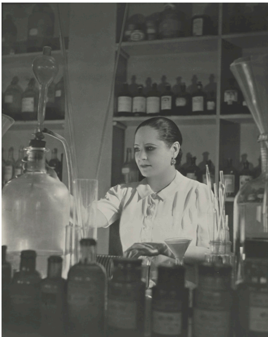
3. Helena Rubinstein photographed by Boris Lipnitzki in her laboratory at Saint-Cloud 1930s Paris, Archives Helena Rubinstein - L'Oréal