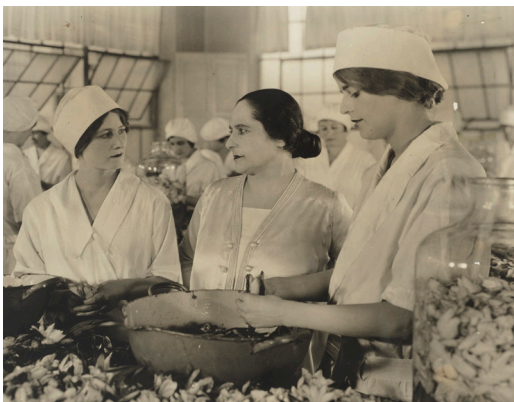
The factory at Saint-Cloud circa 1924 Paris