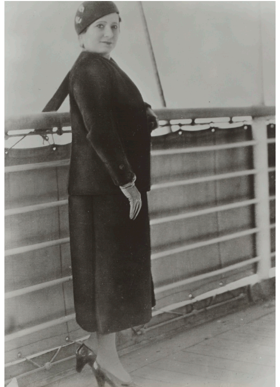
2. Helena Rubinstein wearing a suit by Coco Chanel Paris, circa 1920 Paris, Archives Helena Rubinstein - L'Oréal; all rights reserved