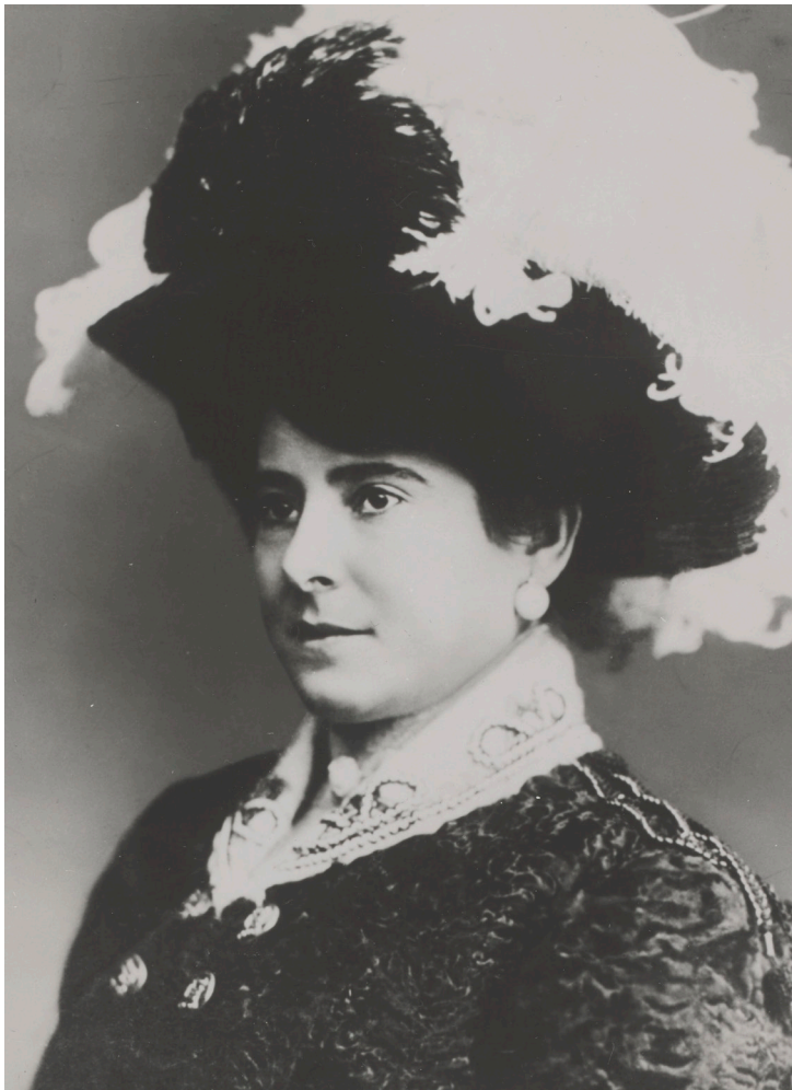
Helena Rubinstein's visiting card in Vienna circa 1895