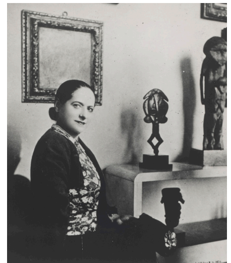
Helena Rubinstein photographed by Boris Lipnitzki in her apartment in boulevard Raspail 1920s Paris, Archives Helena Rubinstein - L'Oréal