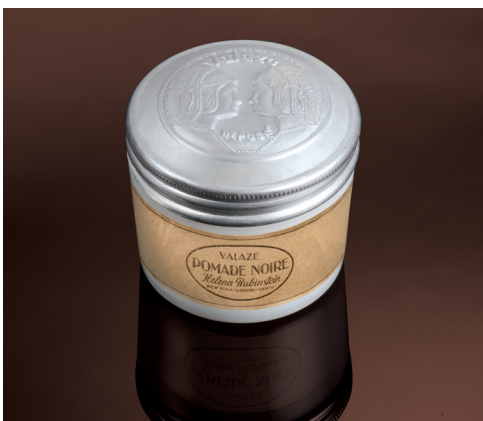
"Valaze Pommade Noire" jar

Helena Rubinstein returned to Europe in 1905, first to Poland, where she hired two of her sisters and a cousin to work with her in Melbourne, then she went to London, Paris and Germany. She met doctors, dermatologists and plastic surgeons, visited thermal spas and understood the importance of the scientific discoveries she applied to beauty. She was the first to classify skin into three groups and submit her products to rigorous tests.