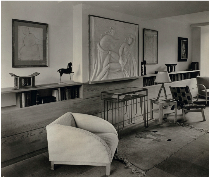
9. Helena Rubinstein's beauty salon in New York 1937 Paris, Archives Helena Rubinstein - L'Oréal; all rights reserved