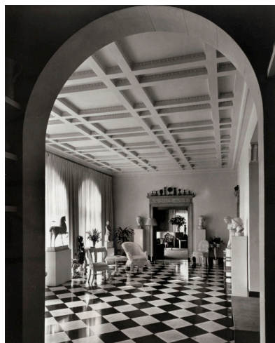
Helena Rubinstein's apartment in New York 1940s Paris, Archives Helena Rubinstein - L'Oréal; all rights reserved