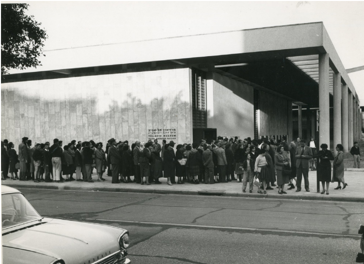
Inauguration of the Tel Aviv Museum of Art 1959

She expressed her faith in the young nation by financing the Helena Rubinstein Pavilion for Contemporary Art at the Tel Aviv Museum of Art, which, although disappointed by its architecture, she inaugurated in January 1959. To mark the occasion, she donated a portrait of herself by the Brazilian painter Candido Portinari and two pictures by Maurice Utrillo. Later, she bequeathed her collection of miniature houses to the museum and built a new factory in Israel, inaugurated in 1962.