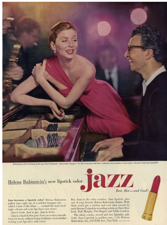
11. Madame's jewellery Paris, Archives Helena Rubinstein - L'Oréal; all rights reserved