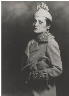
Helena Rubinstein in a coat probably by Coco Chanel Circa 1930 Paris

1913 Construction of a laboratory at Saint-Cloud; creates a makeup line with the couturier Paul Poiret; In Paris's flea markets, buys antique powder compacts and boxes and has them copied to package her products.