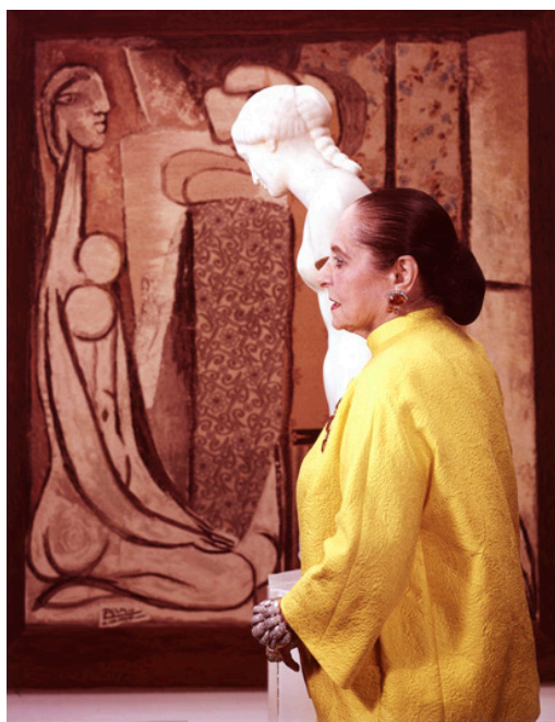
7. Helena Rubinstein photographed by Erwin Blumenfeld New York, circa 1955 © The Estate of Erwin Blumenfeld.