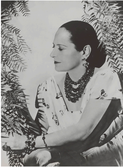
1. Portrait of Helena Rubinstein 1953 Paris