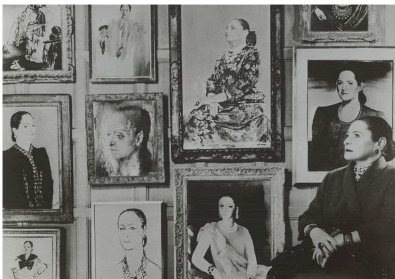
8. Helena Rubinstein with her portraits by Salvador Dali, Marie Laurencin, Candido Portinari, Graham Sutherland, Pavel Tchelitchev and others New York, 1940s-1950s