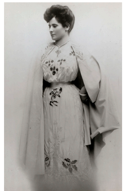
Helena Rubinstein wearing a dress by Charles Frederick Worth