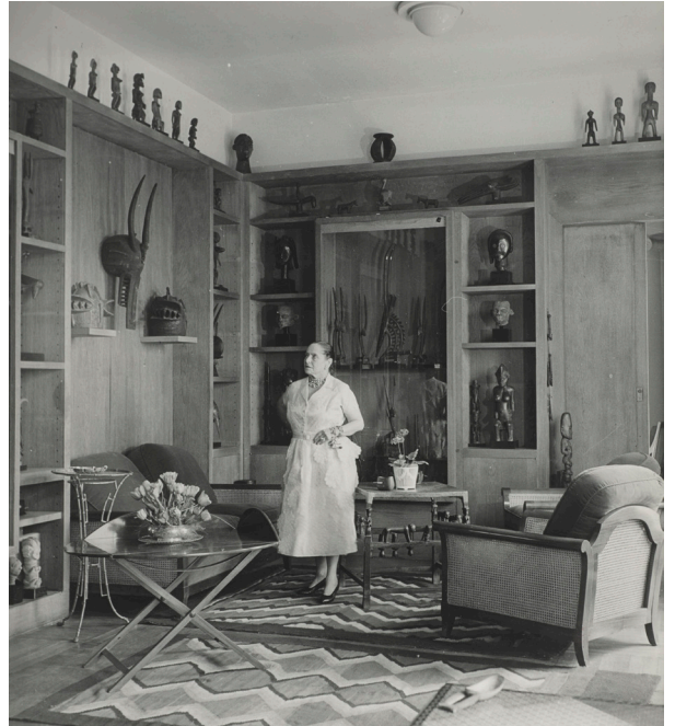
10. Quai de Béthune, Paris, with her primal arts collection Paris