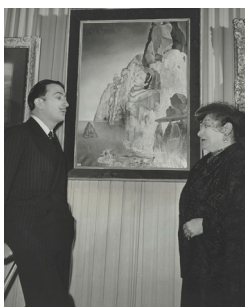
Helena Rubinstein with Salvador Dalí in front of his portrait of her New York, 1940 s