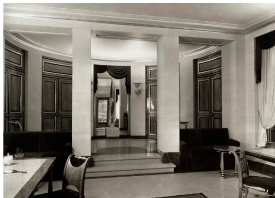
Maurice Routhier, the salon at 52 rue du Faubourg-Saint-Honoré Paris, after 1945 Paris, Archives Helena Rubinstein - L'Oréal; all rights reserved