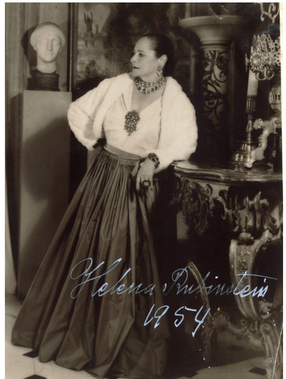
4. Helena Rubinstein in her apartment in New York 1954