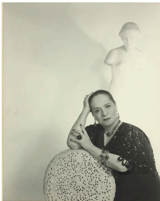
5. Helena Rubinstein photographed by Cecil Beaton New York, 1951