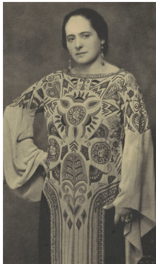
Helena Rubinstein in a dress by Paul Poiret Paris, 1910 Paris, Archives Helena Rubinstein - L'Oréal Photo Nickolas Muray © Nickolas Muray Photo Archives